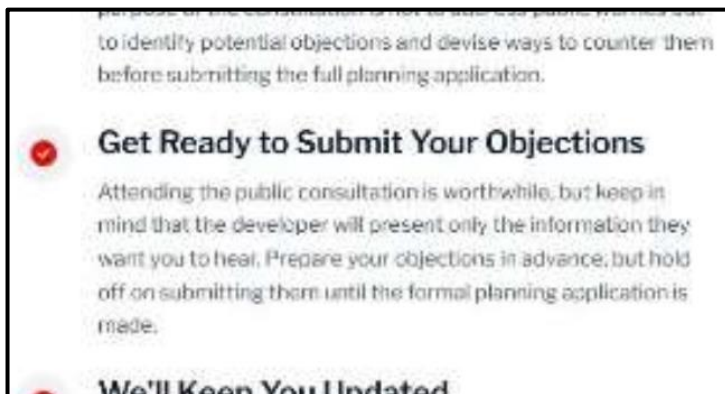
Fig1. Developer's blurred Submission.

This image has been partially blurred by the Developer making it difficult to read. We suspect this was deliberate. As you can see, the image was absolutely clear on our website.